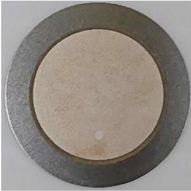
Example of electrode sulfidation